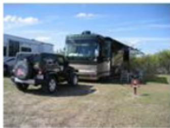
Ed's old RV camper breaks down. He traded it in for a newer model.