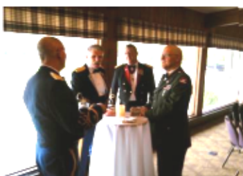
Members waiting for a largertable?